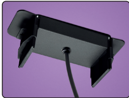
Blade mounting under desk with NEW ZIP toolless clamps.

Sleek low-profile, modular design customised to meet the individual's needs. Anodised solid aluminium body for durability and aesthetics with plastic sides, which allow for custom width adjustments. Fully customisable modular designed unit that fits in any desktop finish. Ideal for high-end computer workstations. Through wiring to allow for "daisy chain" installations via interconnect leads and splitter block.